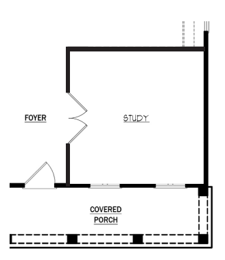
Opt. First Floor with Study