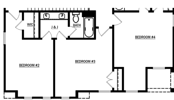
Opt. Second Floor with 4th Bedroom