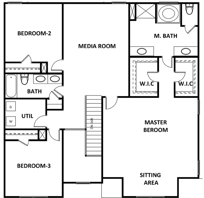
SECOND FLOOR W/ MEDIA OPTION